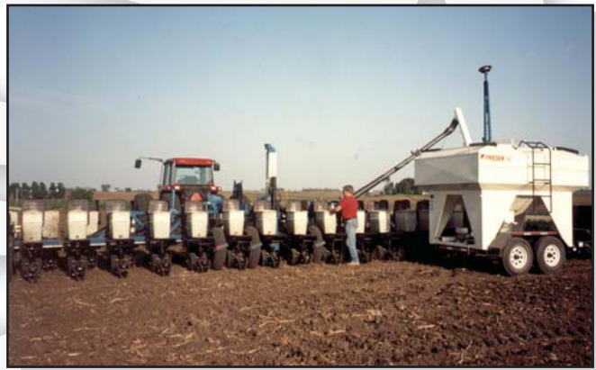
Quick and easy loading of seed into planter.