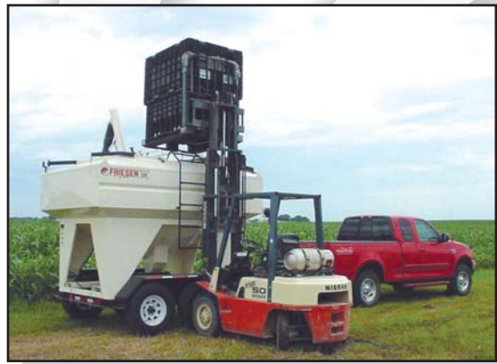
Quick and easy loading of seed into Bulk Seed Tender®